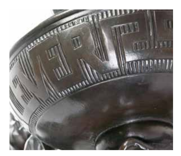
16 A pair of bronze torchères